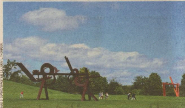
ART WALK Mark di Suvero's 'Mozart's Birthday' (1989), left, and 'Frog Legs' (2002) at Storm King